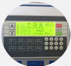
PLC control with 5 program memory