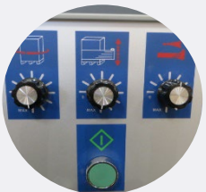
Independent dial controls for • Turtable speed • Carriage speed • Pre-stretch motor