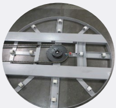
12 load bearing roller supports